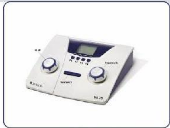
MA 25 function buttons

The MA 25e extends the MA 25 functionalities with an automatic test according to Hughson-Westlake. Parameters can easily be adapted to your personal preferences. The Talk Forward function makes the MA 25e easy to work with particularly in sound booth installations.